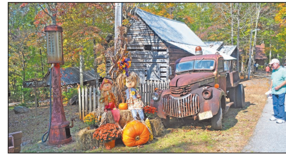
The 2017 Georgia Mountain Fall Festival is here, so head on over to the Georgia Mountain Fairgrounds this week and weekend!