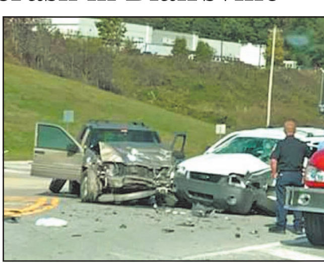
A drive-by picture of the Friday, Oct. 13, fatal car crash at the turn in to the Blairsville Walmart on Georgia 515. Photo/ Ford Escape on the driver's

"The Ford Escape failed to yield the right of way and traveled into the path of a Jeep Grand Cherokee, driven